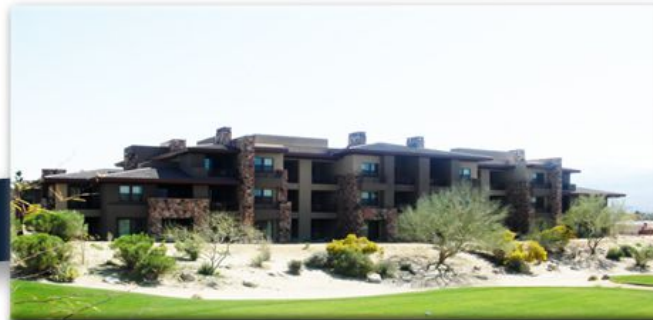
EXTERIOR FINISHES ARE APPLIED