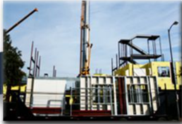
PANELS ARE TRANSPORTED TO SITE