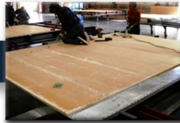
PANELS ARE INSULATED AND CLADDED