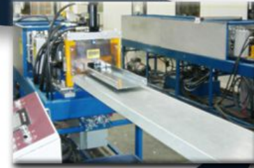
COMPONENTS ARE ROLL FORMED