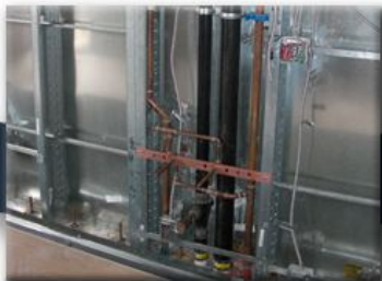
TRADE SERVICES ARE COMPLETED