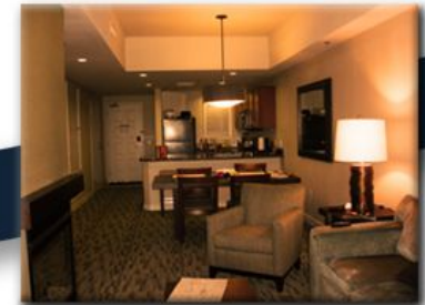
INTERIOR FINISHES ARE APPLIED