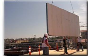
PANELS ARE INSTALLED