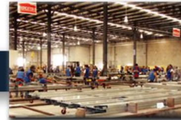
PANELS ARE FABRICATED