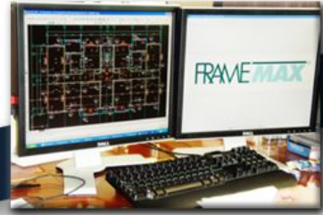
PLANS ARE INPUT INTO DESIGN SOFTWARE